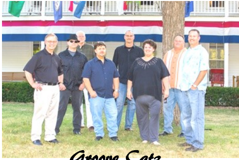
Groove Catz 12:00—2:00 PM