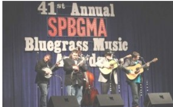
NEW BALANCE BAND

IN CASE OF RAIN BANDS WILL PERFORM AT THE COMMUNITY BUILDING